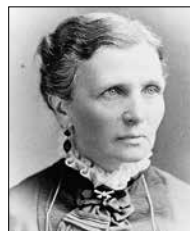
Emmeline B. Wells